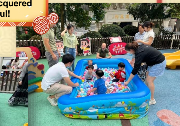
You can find many traditional Chinese foods in the ball pool