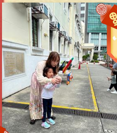
Look, the rocket rises so high!